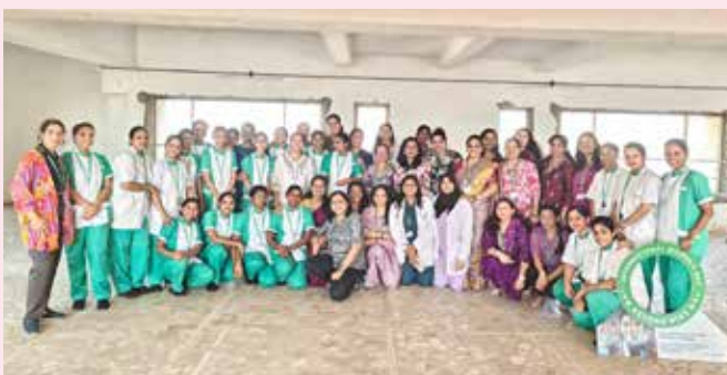
SL Raheja Hospital, Mahim