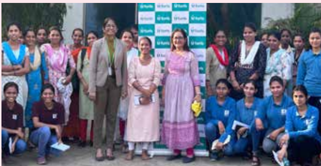
Fortis Hospital, Kalyan