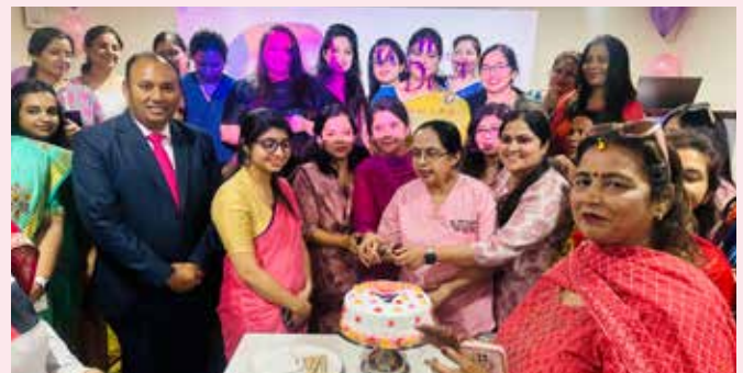
Fortis Escorts, Faridabad