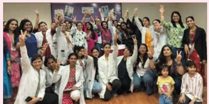
Fortis Hospital, Jaipur