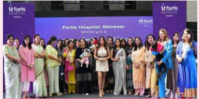
Fortis Hospital, Manesar