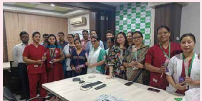
Fortis Hospital & Kidney Institute, Kolkata