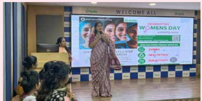
Hiranandani Hospital, Vashi