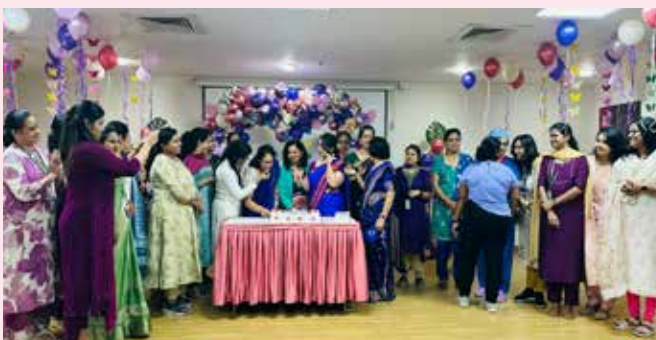
Fortis Hospital, Bengaluru