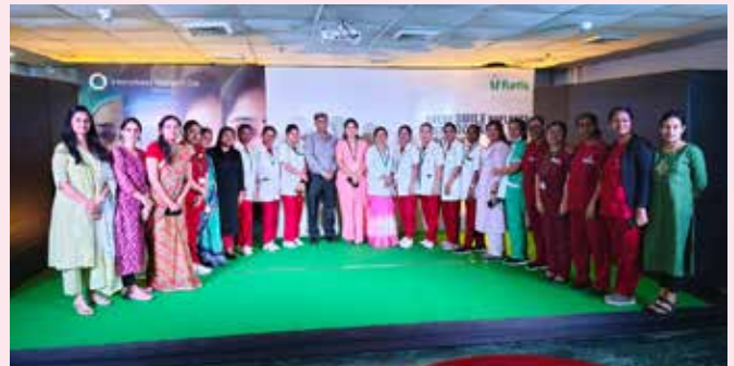
Fortis Hospital, Anandapur