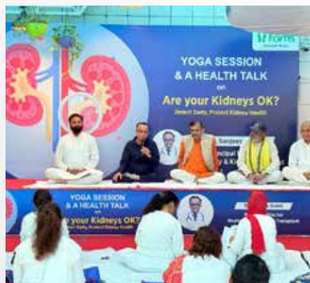
Fortis Hospital, Vasant Kunj