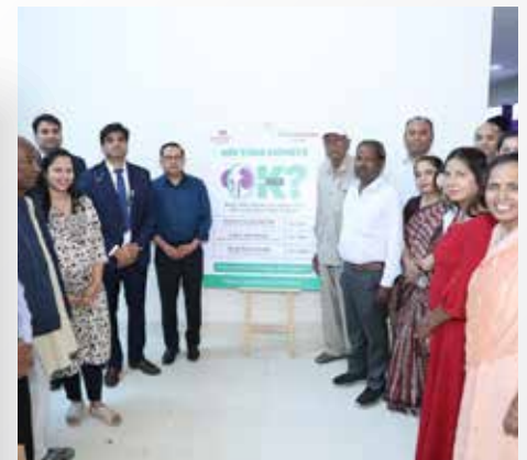
Fortis Escorts, Faridabad