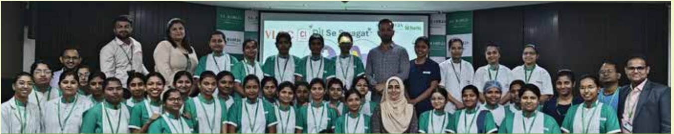
SL Raheja Hospital's Nursing and administrative teams with experts from VLCC, at Dil Se Swagat