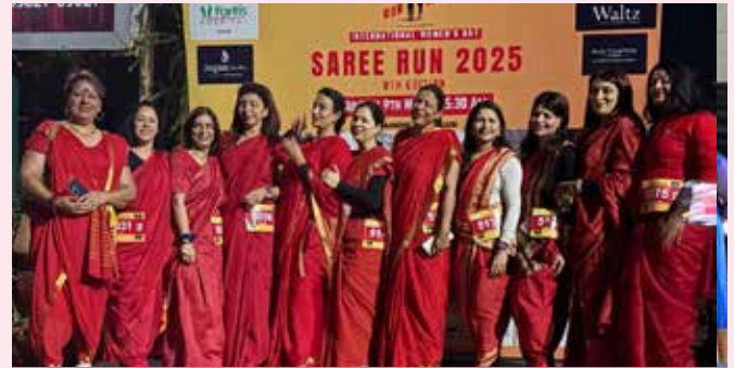
Fortis Hospital, Mohali