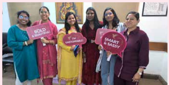
Fortis CDC, New Delhi