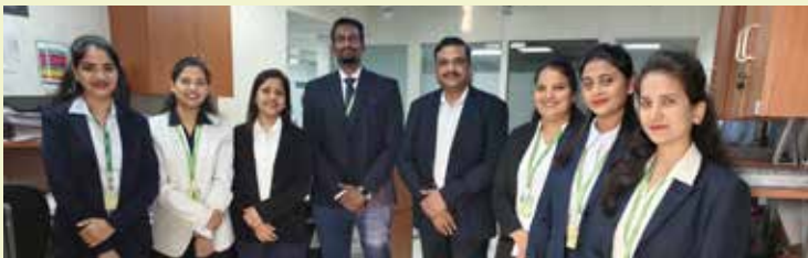
Fortis Kalyan team on day 2 – focusing on western formal attire