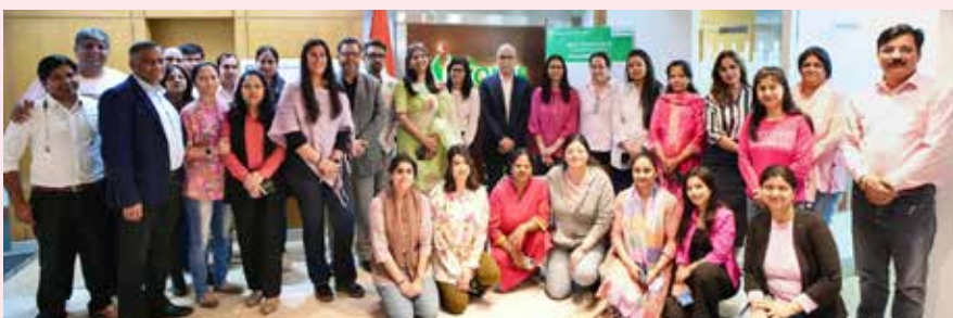
Corporate Office, Gurugram