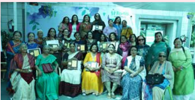
Fortis Hospital, Vasant Kunj