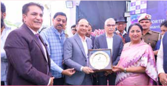
Fortis Hospital, Shalimar Bagh