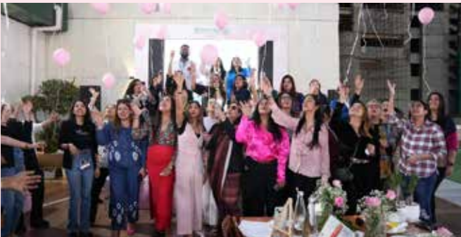
Fortis Hospital, Gurugram