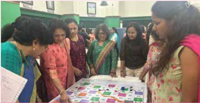
Fortis Hospital, Mulund