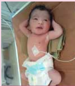
Baby of Mahalakshmi N- Nagarbhavi Unit