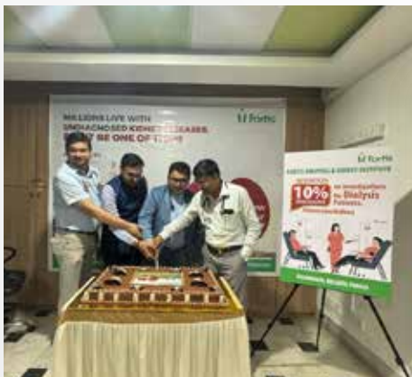
Fortis Hospital & Kidney Institute, Kolkata