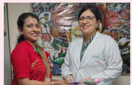
Fortis Medical Centre (FMC), Kolkata