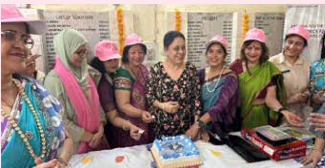
Fortis Escorts, Okhla Road